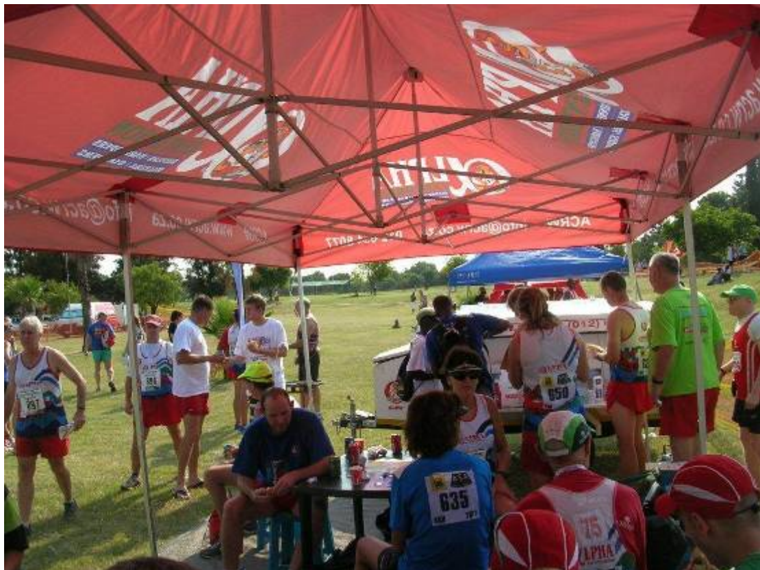
'n Aantal Skillies geniet 'n bier en worsrol na afloop van die wedloop.